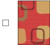
Collin County Telephone Directory Collin County/McKinney/Allen