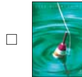
Lake Ray Hubbard Telephone Directory Lake Ray Hubbard Rockwall/Rowlett