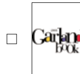
The Garland Book