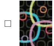
The Park Cities Book