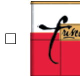
The Frisco Book/ The Colony Book