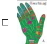
The Flower Mound Book/ The Lewisville Book