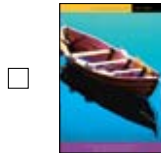
The Lake Cities Telephone Directory Lake Cities/Wylie/Sachse