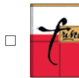
The Frisco Book/ The Colony Book