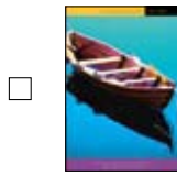
The Lake Cities Telephone Directory Lake Cities/Wylie/Sachse