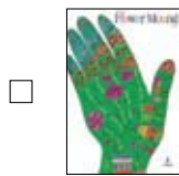
The Flower Mound Book/ The Lewisville Book