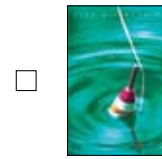
Lake Ray Hubbard Telephone Directory Lake Ray Hubbard Rockwall/Rowlett