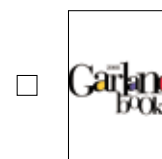
The Garland Book