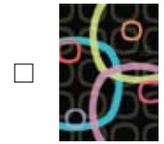
The Park Cities Book