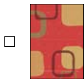
Collin County Telephone Directory Collin County/McKinney/Allen